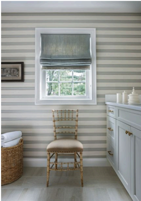
Marianne Jones, LLC | 2ND