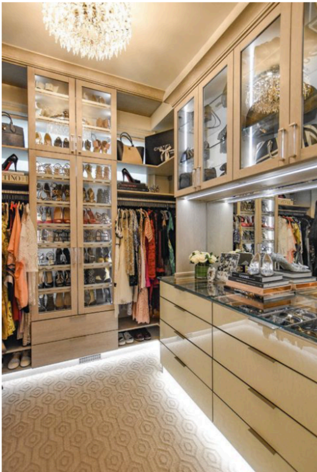
Neat Method Professional Organizing, | 2ND with California Closets