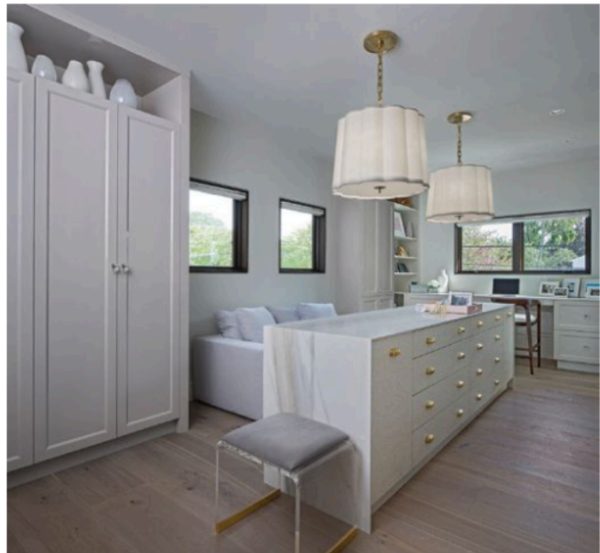
Maison | 3RD Birmingham