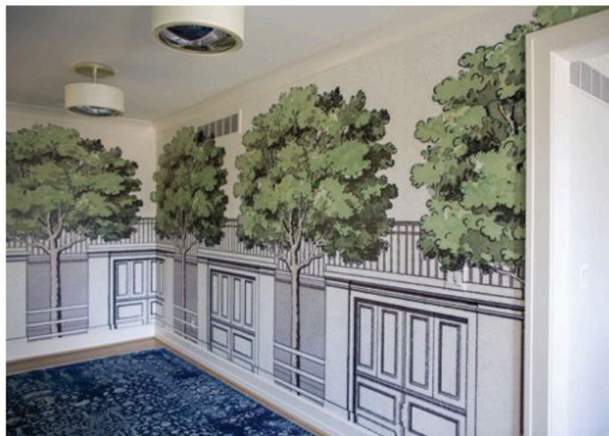
Port Mfg. & Design | 3RD